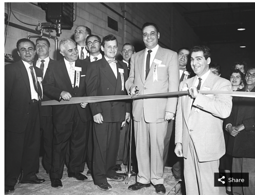
Photo was taken at the official opening of a new Vine-Co processing facility in South Vineland, 1956.

⇐ Milestone reached: Vine-Co's volume increased from 85 cases of eggs in 1951 to over 5000 cases in 1956